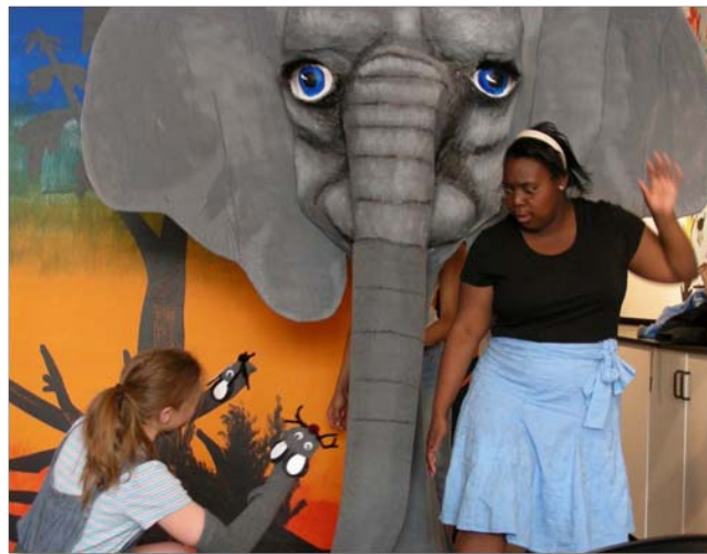
VSA arts Colorado