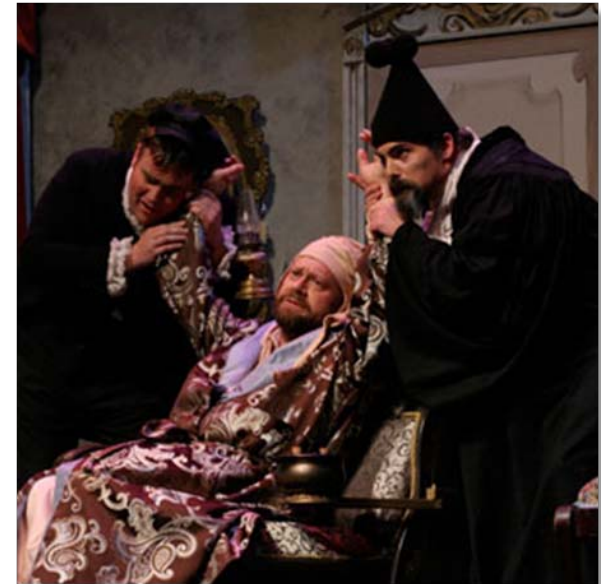
Creede Repertory Theatre