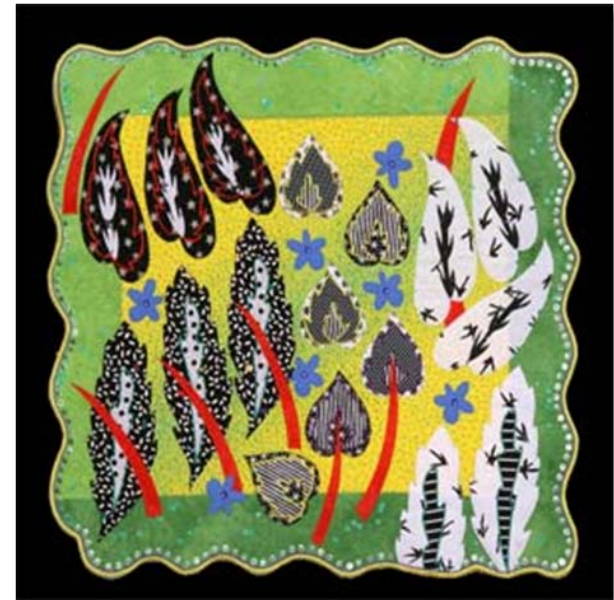
City of Longmont - Museum