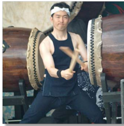
Crestone Performances, Inc.