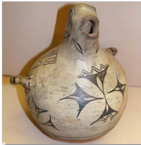
Koshare Indian Museum, Inc.