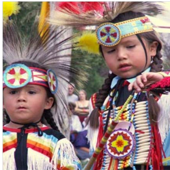
City of Delta - Council Tree Pow Wow