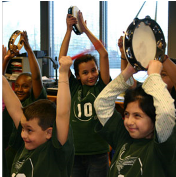
City of Aurora - Cultural Services Division